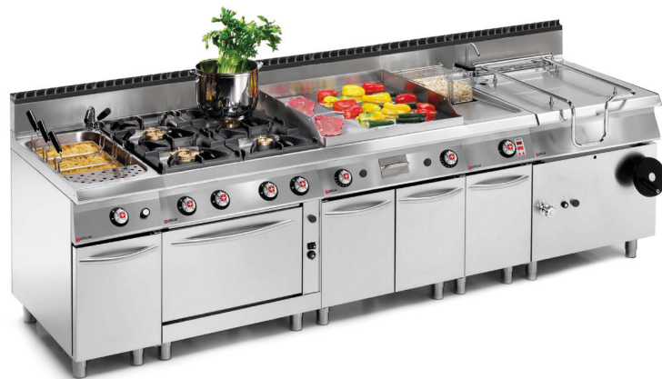
COMPLETE MODULAR COOKING LINE