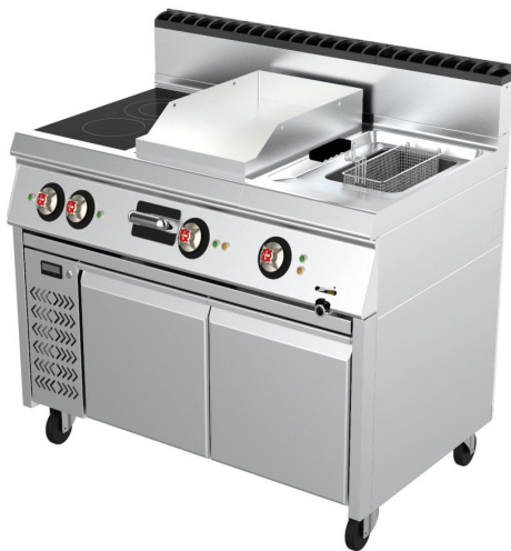
COOKING STATION ON WHEELS – REFRIGERATED BASE