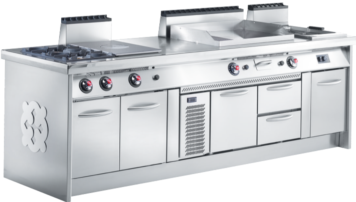
TAYLORED COOKING BLOCK