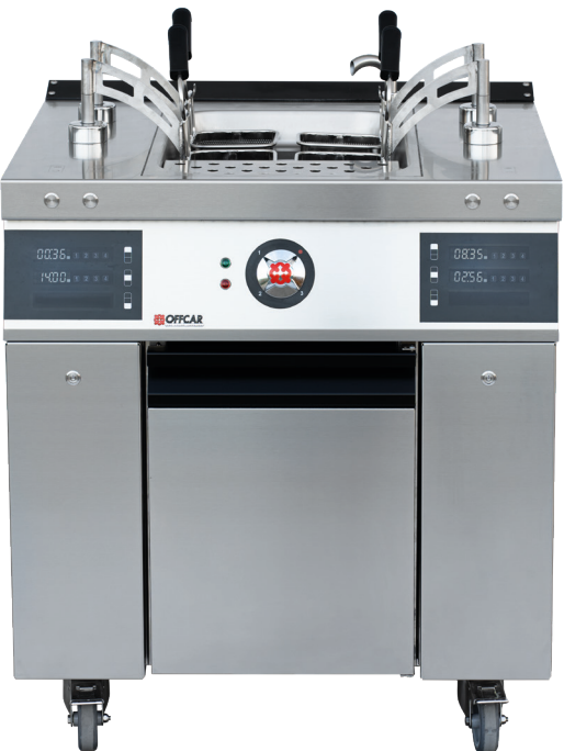
AUTOMATIC PASTA COOKER