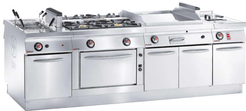
CENTRAL COOKING LINE