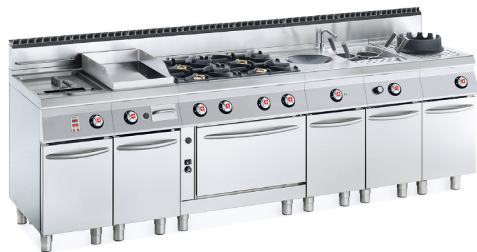
COMPLETE MODULAR COOKING LINE