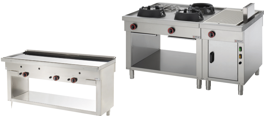
WOK – TEPPANYAKI – DIM SUM